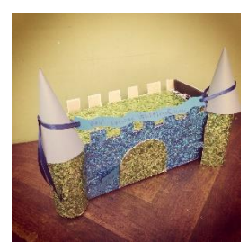
No bigger than a shoe box please!

On a great day out, you need a packed lunch. Record how much each of these things weigh.