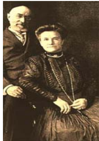
Figure 4: Mr and Mrs. Straus. Given an opportunity to save herself by getting on a lifeboat 2 , Mrs. Straus chose to stay behind with her husband, knowing it meant certain death.