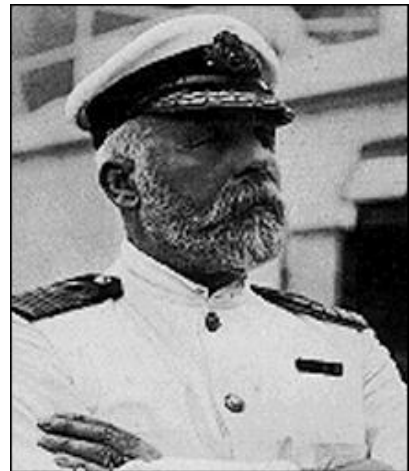
Figure 1: Captain Edward John Smith. He ordered the crew to maintain their course and speed despite numerous warnings about icebergs in the area.

3 One of the most disturbing things about this terrible tragedy is that it could have been avoided. The telegraph operator aboard the Titanic had received numerous warnings about huge icebergs from other ships navigating through the area off Newfoundland, Canada. The operator delivered the messages to the ship's captain. The captain, however, decided to keep the ship sailing at near top speed – over 23 miles per hour, even though it was nighttime and difficult to see. By the time the crew realized an iceberg was looming directly in front of them, it was too late. They could not turn the huge vessel and avoid collision. At 11:40 p.m. on the night of April 14, 1912, an iceberg grazed the side of the ship causing her to take on water. Three hours later, the Titanic was a part of history. Over 1,500 people died in the icy waters that night.