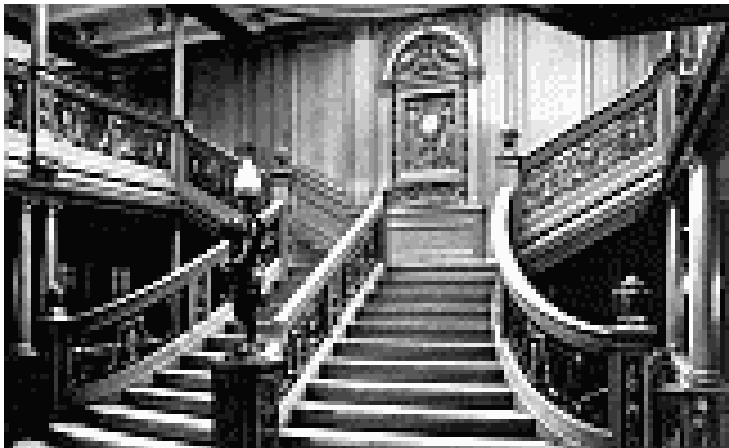
Figure 3: The grand staircase of the first class section of the Titanic .