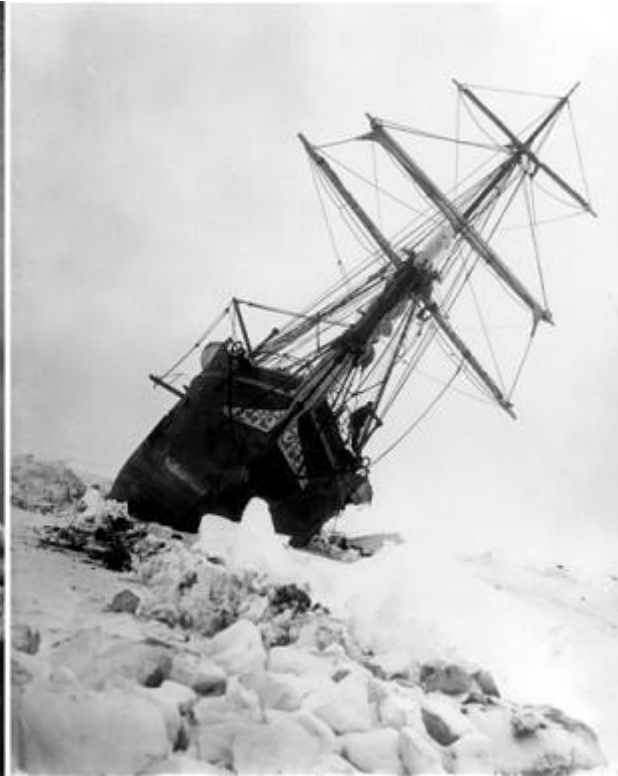
Explorer-Ernest Shackleton 1874-1922