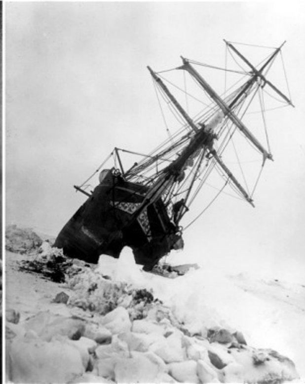
Explorer-Ernest Shackleton 1874-1922