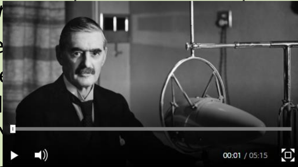
Statement by the Prime Minister, BBC Home Service, Sunday 3 September 1939, 11:15

Appease me their way. It was the deal with Hitler's Germany. World War. Prime Minister Neville Chamberlain dealt with Hitler was in Europe, without a fight, in the hope that he would stop making any further demands. Britain allowed Hitler to have his way.