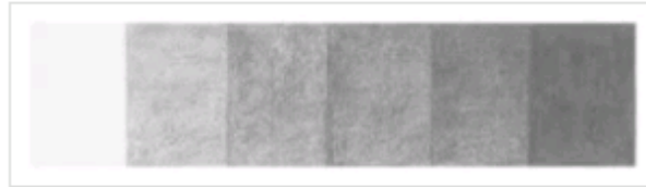
A Tonal Scale - Light to Dark Tones

Tone is crucial in drawing and painting, a tonal value means how dark or light something appears. We can see tones more clearly when a direct strong light falls on an object or subject.