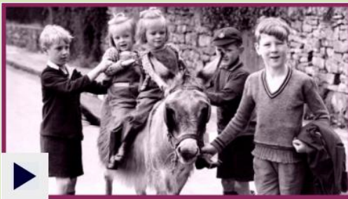
Interviews with a host family child

https://www.bbc.co.uk/teach/school-radio/history-ks2-world-war-2-clips-ww2-evacuation-index/zvs3scw