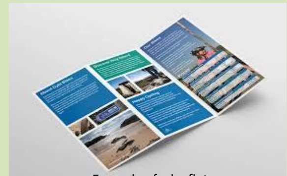
Example of a leaflet