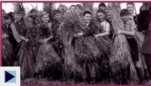
Host families interviewed

A host family describes the experience of receiving evacuees.