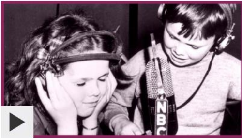
Children evacuated abroad

https://www.bbc.co.uk/teach/school-radio/history-ks2-world-war-2-clips-ww2-evacuation-index/zvs3scw