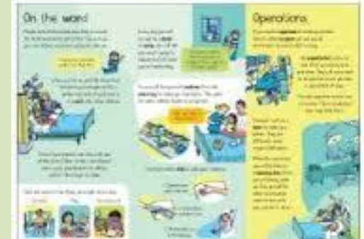
Example of a leaflet